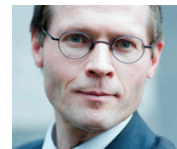
Olivier de Schutter