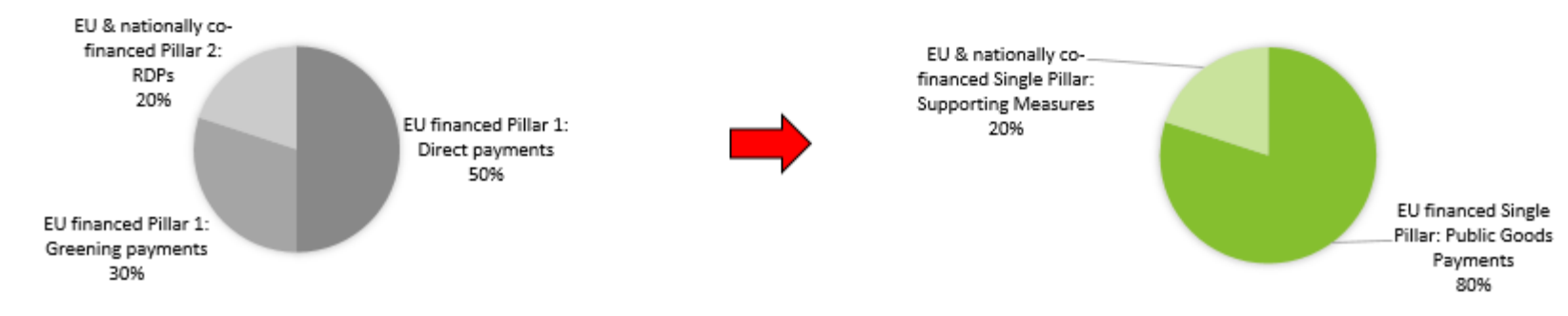
Figure 2: Moving beyond the status quo towards EU agricultural spending based on public