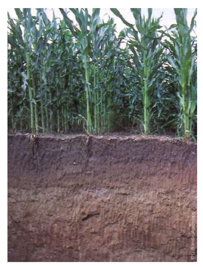
Soil profile, with a humus rich top horizon under maize. This soil needs regular organic matter replacement through forage legume cropping, green manure and farmyard manure application because of the pronounced carbon losses associated with maize cropping for silage.

Finally, as a knowledge based system organic agriculture is well placed to use local farmers' knowledge and locally adapted varieties and breeds. It can foster an adaptive and often participative learning approach to the development of crops and practices. These are important sources for greater diversity and adaptation in agriculture.