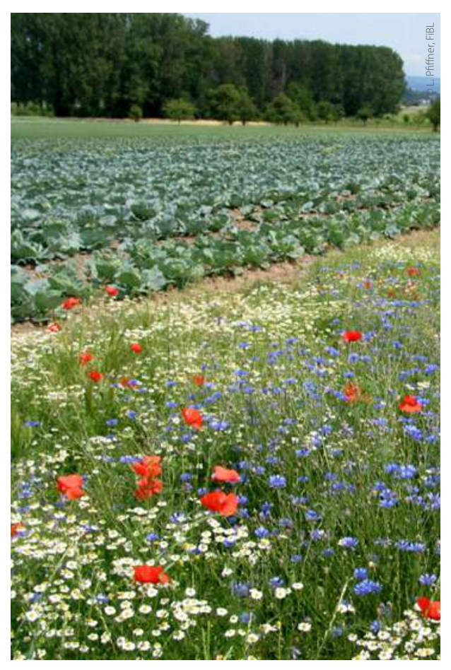
Flower strip besides a cabbage field which provides habitat for beneficial organisms, essential for pollination and disease and pest control of crop plants.

Several key inferences can be made regarding agriculture, based in this understanding of the effects of climate change. As formulated in Müller et al., (2012, p104) , for example, "First, impacts vary strongly per region. [...] Second, water will be a key issue, in particular due to water scarcity and drought, but also because of extreme precipitation events, waterlogging