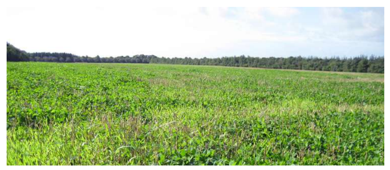
Cover crops contribute to climate change resilience in several ways: they improve the structure of soils and thus also their water holding capacity and water infiltration; they reduce the extent of soil erosion; and they reduce nitrate leaching. Denmark, September 2012.

Improving soil organic matter and soil structure helps to reduce the impacts of droughts and high intensity rainfall by improving water infiltration into the soil. Along with this increased rainwater harvest, the water supply to crops also improves due to better soil water retention and root growth.