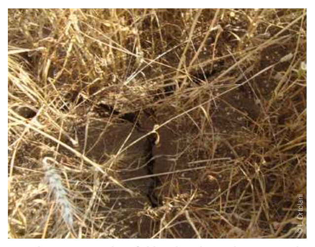
Drought impacts on wheat field: Soil cracks. Puglia region, Italy, 2011.

temperature variability resulting from anthropogenic climate change, which is expected towards the end of this century ( Schär et al., 2004 ). Since 2003 severe heat waves have had an adverse effect on crop production in western Europe in 2005 and 2006, and in eastern Europe in 2007, 2010 and 2012.