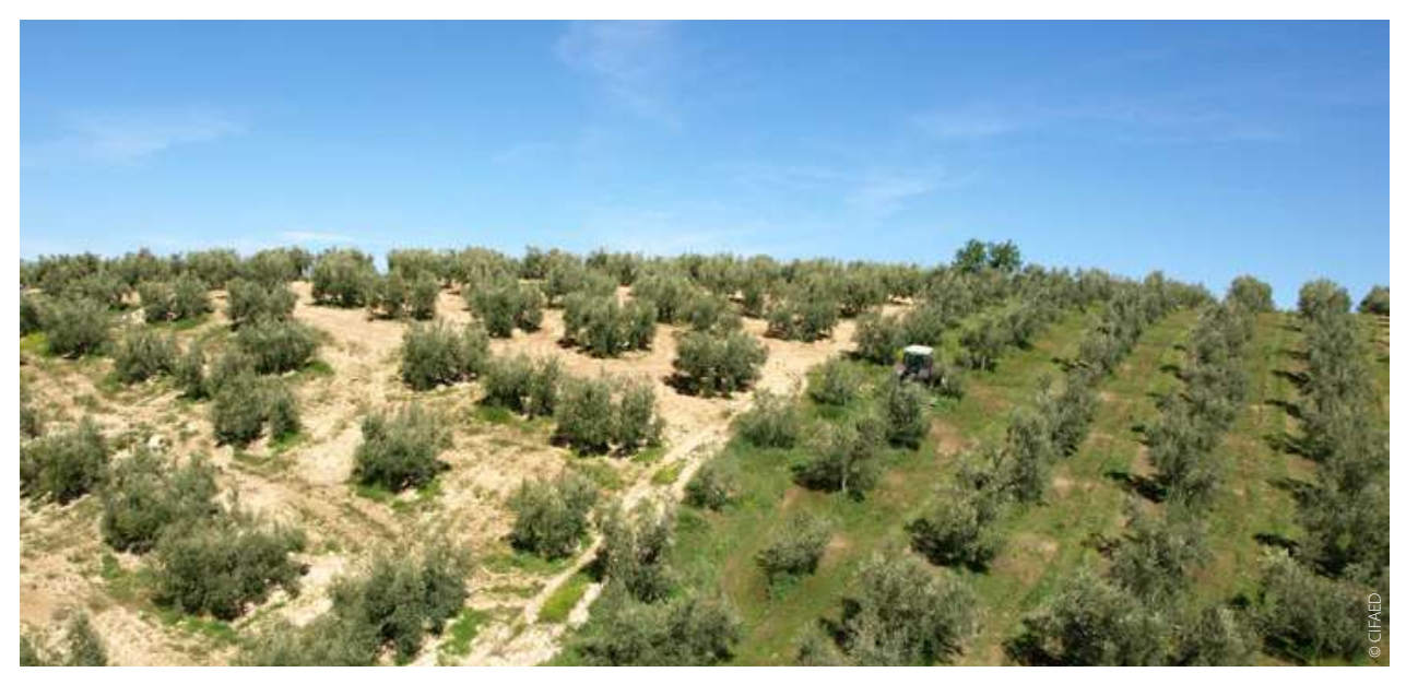
Organic olive grove with cover crops compared to a conventional grove with bare soil. Deifontes, Andalusia, Spain. 2008.

To sum up, the Mediterranean region faces a great challenge from climate change, which is predicted to affect agricultural productivity severely. Organic farming is based on the cycling of organic matter and on crop diversification, both of which contribute to the maintenance and improvement of soil fertility as well as the sustainable productivity of agro-ecosystems. These two basic elements, together with the associated savings in fossil fuels, offer broad potential to promote the success of climate change mitigation and adaptation measures in Mediterranean agriculture.