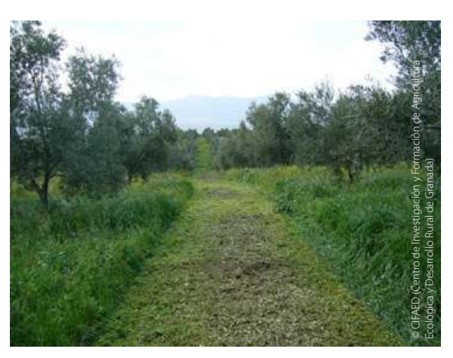
Mulched organic residues (pruned foliage and cover crops) applied to an organic olive grove. Deifontes, Andalusia, Spain, 2007.

The use of cover crops for nitrogen fixation and many other functions is common practice in organic farming systems. Cover crops encourage higher levels of biodiversity in the cropping systems ( Cotes et al., 2009 ), which contributes to systems' resilience. From a climate change perspective, cover crops provide many other benefits, such as raising the amount of soil organic carbon ( Aguilera et al., 2012a ), drastically reducing the risk of erosion, and enhancing water infiltration capacity. For example, the presence of cover crops in sloping olive groves – a typical crop type in the Mediterranean region – reduces water runoff by 45–95% and soil erosion by 60–98% during the rainy season, compared to olive groves with bare soil. Cover crops in organic olive orchards have been shown to effectively increase water availability in dry periods, provided that they are properly managed ( Guzmán and Foraster, 2011 ).