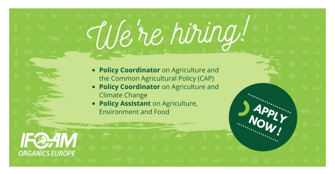
Hiring now - Colleagues on climate change, the CAP, and organic policies

IFOAM Organics Europe is seeking three self-motivated and responsible people to join our Policy Team: