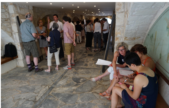
Discussions at the AgriSpin end conference in Crete

IFOAM EU took part in the final AgriSpin conference organised at the Mediterranean Agronomic Institute of Chania, Crete. The AgriSpin partners and external participants discussed the results and the recommendations of the project. The focus of the conference was on strengthening innovation in agriculture by looking at the innovation process, the stages of innovation and innovation support services. The final recommendations of the project and the inspirational booklet with the best practice examples will be available on AgriSpin website in the autumn.