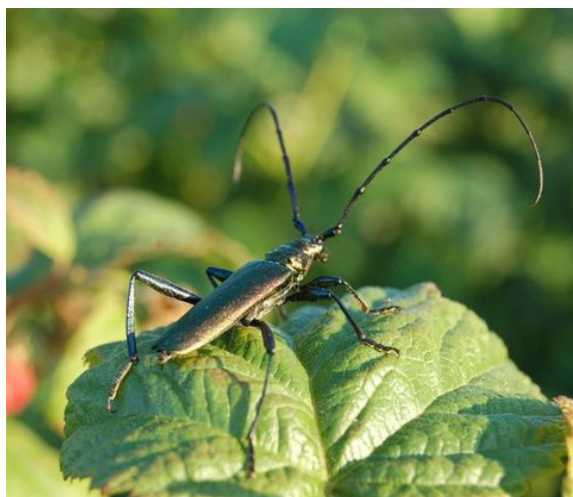
IFOAM EU is a partner in the Internet of Food and Farm 2020 (IoF2020) project. A number of project case studies explore the use of the Internet-of-Things (IoT) in organic farming . Visit the new IoF2020 website to get informed for the latest news about the project and to sign up for the IoF2020 newsletter to follow the case studies as they unfold; © Triin Viilvere

While IoT technology is yet to be taken up by the majority of organic food and farming actors, there are successful examples of its use in various parts of Europe. For instance, in Italy a tech company AURORAS used wireless sensors to predict three powdery mildew outbreaks in an organic vineyard 12 hours in advance. The predictions helped save around EUR 8000 for the farmer. In the UK, software companies Senseye and Libelium joined forces to increase the crop production and competitiveness of nine organic farms across the country. The installed and connected sensors monitored environmental conditions (humidity, soil moistures, temperature etc.) to predict and warn farmers about threats to their crops.