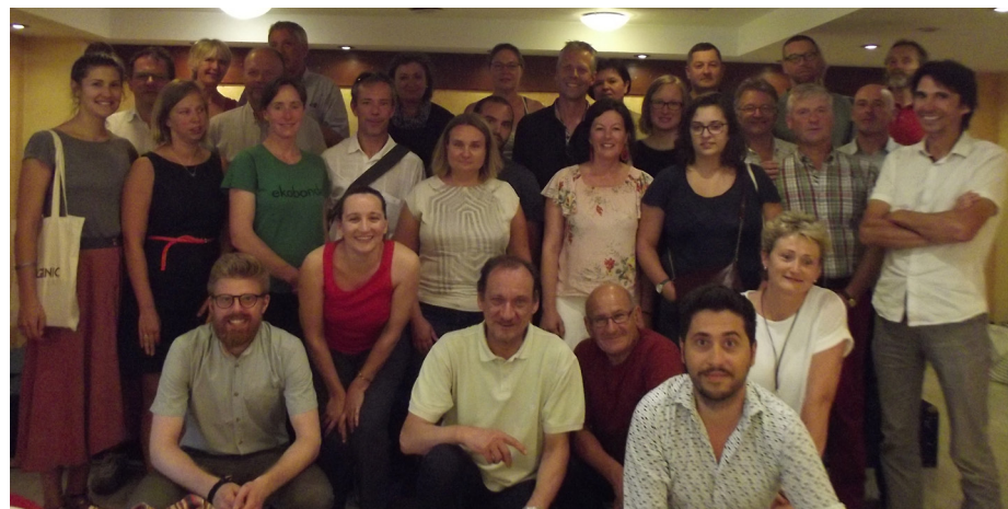
The IFOAM EU's farmers and processors group met for a fruitful discussion in Athens, Greece, on 26–27 June

IFOAM MAKING EUROPE MORE ORGANIC EU GROUP