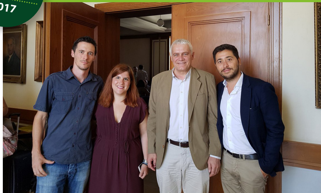
A delegation of IFOAM EU met with Tsironis Gianni, Greek Minister of Agriculture, to discussing the CAP post2020 and the future development of organic food and farming in Greece on 28 June