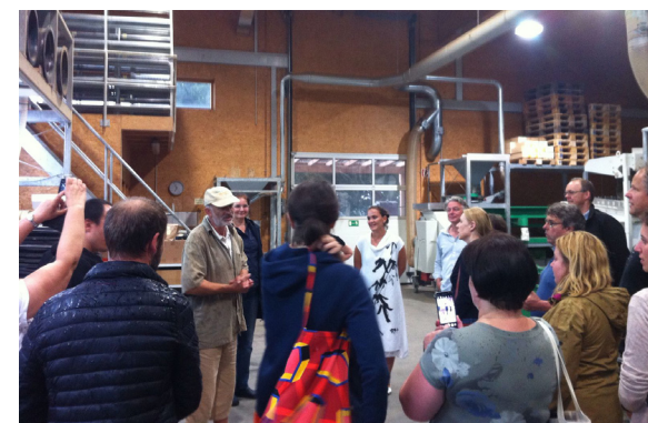
Participants to the Keeping GMO out of food project visit Bingenheimer Saatgut