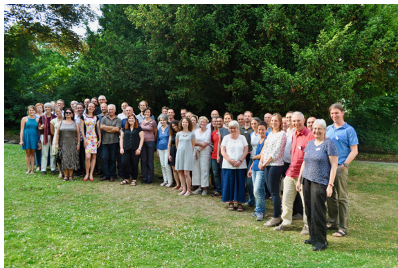
Participants of the kick-off meeting in Leuven; © IFOAM EU

analysis of seed availability and derogations in EU Member States. The first missions to analyse national organic seed systems will start in September in the Baltic states. Follow LIVESEED's developments on Twitter and Facebook . The official homepage with detailed information will be online shortly.